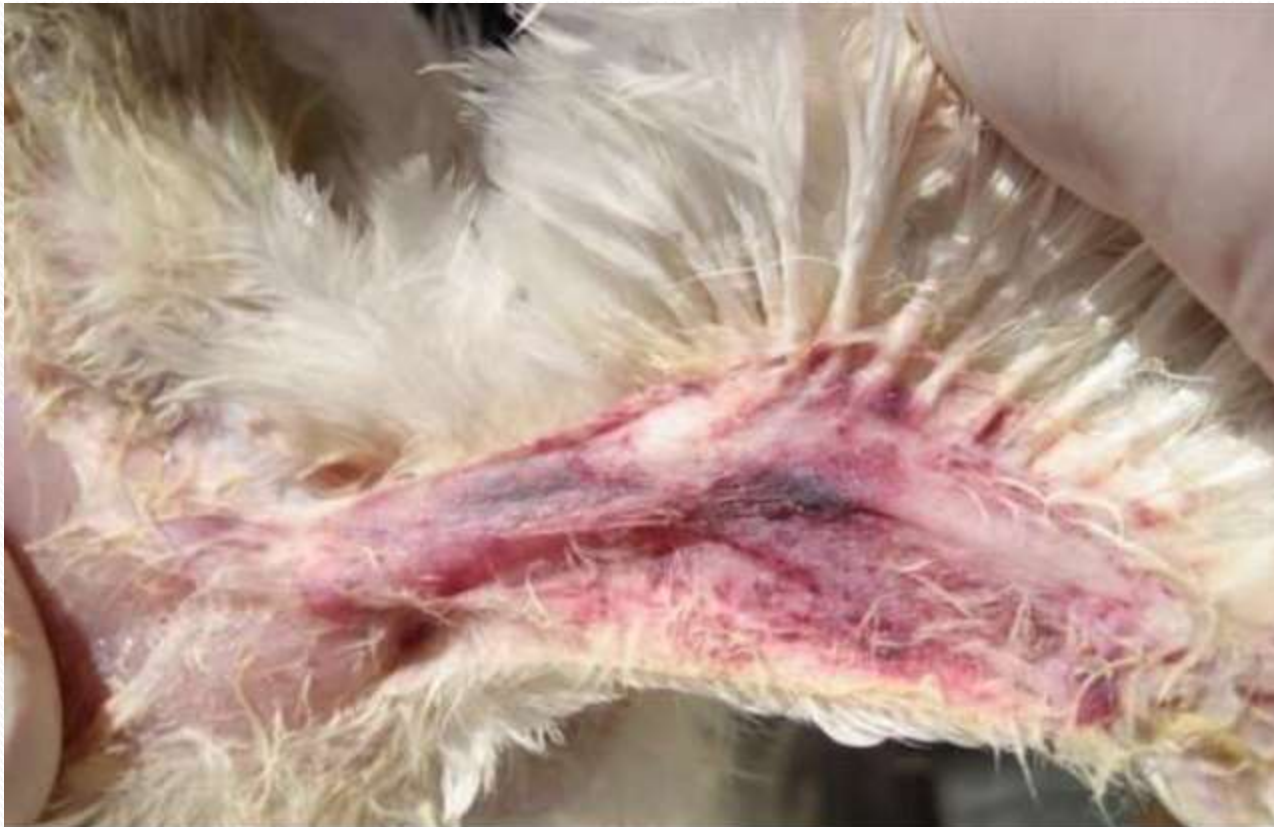
Subcutaneous haemorrhages on the wing of a young chicken with Chicken Infectious Anemia. The name "Blue Wing Disease" is as a result of the blue discoloration seen.