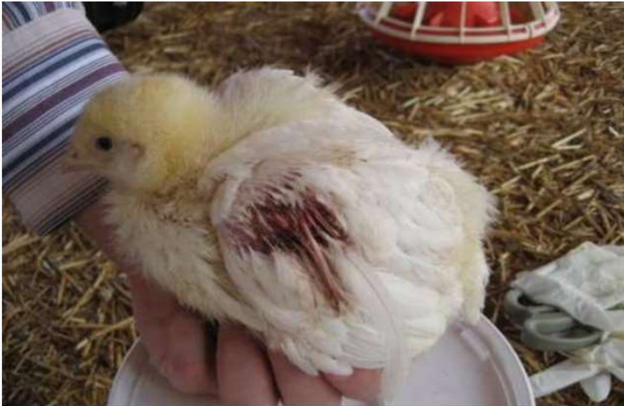
Haemorrhages on the wing of a young chicken with Chicken Infectious Anemia, hence the name Blue Wing Disease.