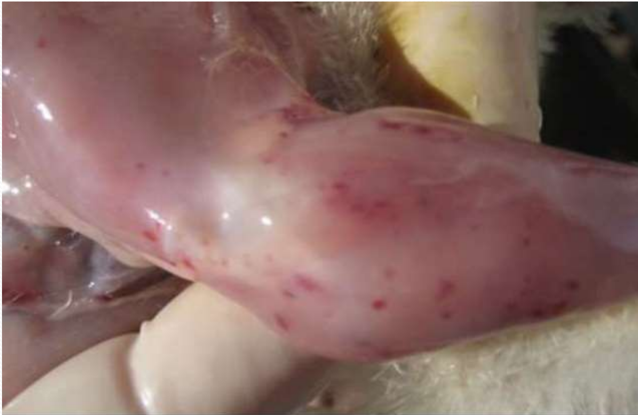
Subcutaneous petechiae on the hock of a young chicken with Chicken Infectious Anemia.