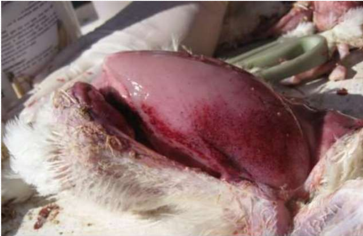
Subcutaneous haemorrhages and petechiae in the breast muscle of a young chicken with Chicken Infectious Anemia.