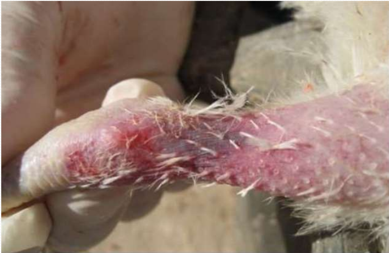
Subcutaneous haemorrhage in a young chicken with Chicken Infectious Anemia, resulting in blue discoloration of the hock joint.